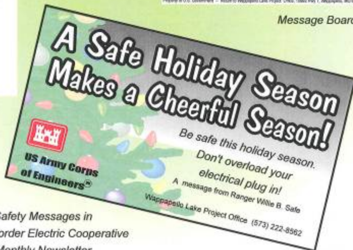
Safety Messages in Ozark Border Electric Cooperative Monthly Newsletter