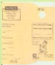
Day Use Fee Payment Vouchers